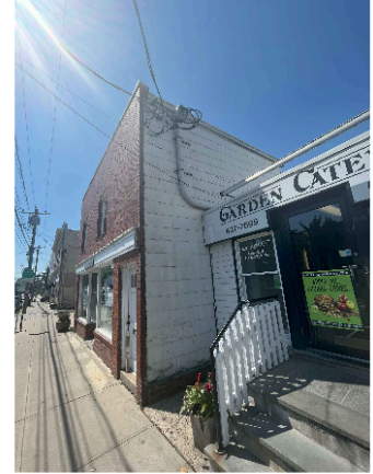
C PART. NORTH ELEVATION SCALE: 1/4" = 1'-0"