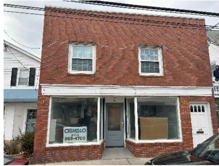
B EAST (S. B. AVENUE) ELEVATION SCALE: 1/4" = 1'-0"