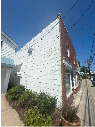
A PART. SOUTH ELEVATION SCALE: 1/4" = 1'-0"